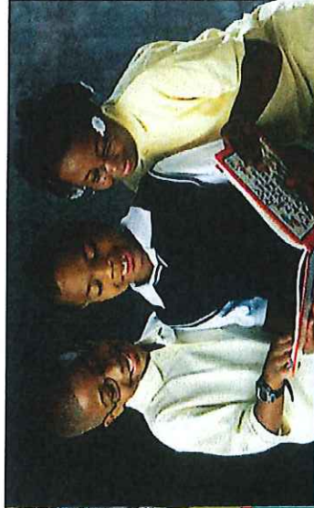
READING & MATH